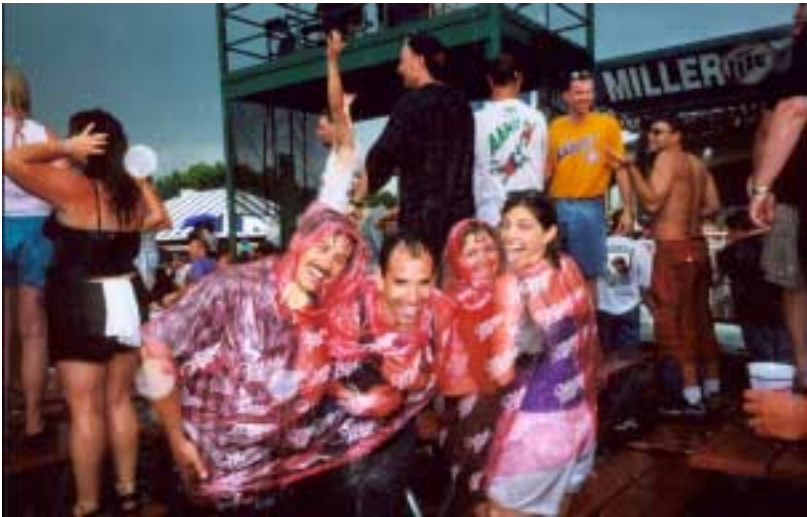
The ponchos make a wonderful gift