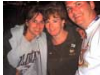
Half of the Twins with our fest-master

gory, the number of times one is found dancing nearly naked on tables is rare, if at all.