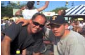
They come for the chicks

While we might have a few beers and do a little flirting while we're at the fest, the real reason we are there is for the music. While last year's line-up was fairly disappointing this year's is fairly decent. Brian Setzer gets promoted from the