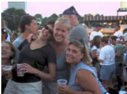
The 2001 rookie crop. Is there a Rookie of the Year in the group?