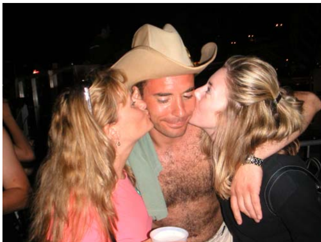
Summerfest Cowboy 2003