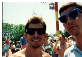
1990: Darker hair and smaller belly

The real question to ask: will we all be here in 2024?